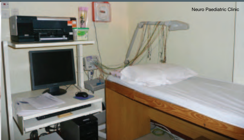
Neuro Paediatric Clinic