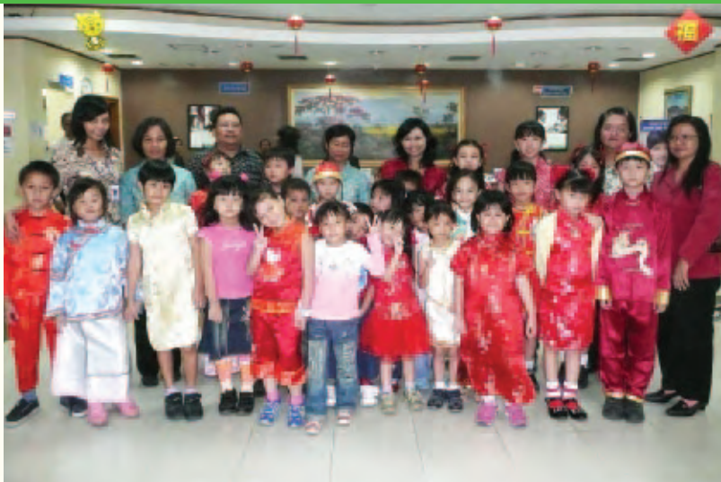
Siloam Hospitals Surabaya held Valentine's Day event at YPPI School, Surabaya on Feb. 12, 2010