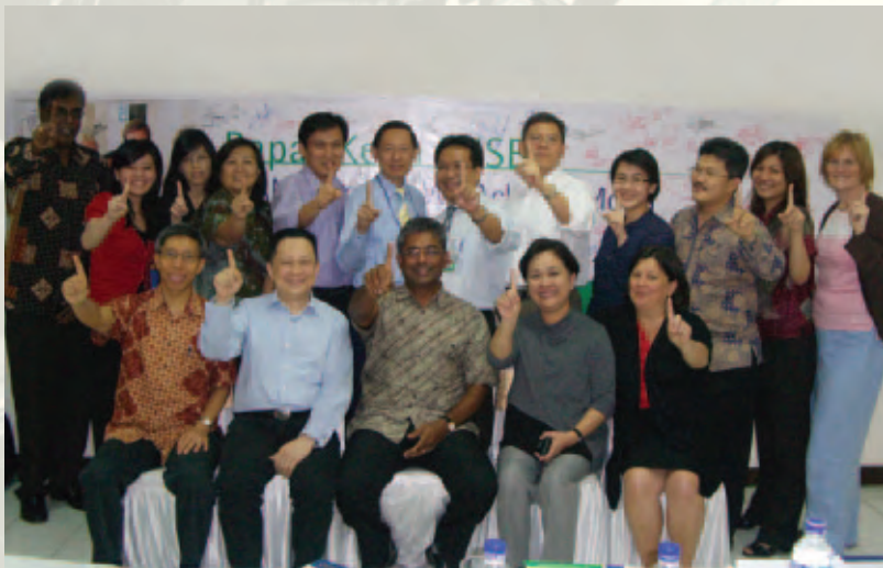
Siloam Hospitals Group Senior Executive Team's Workshop "One Team One Dream" held on March 17 and 18, 2010 in Surabaya