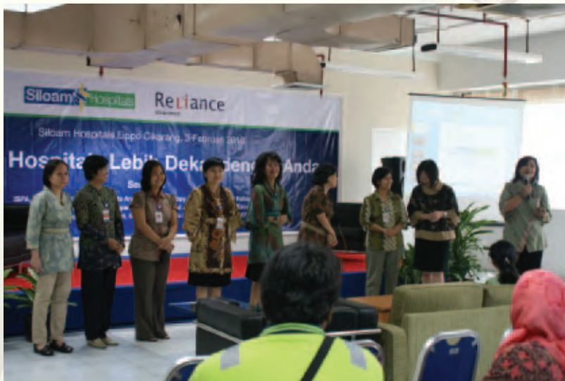
▶ Siloam Hospitals Group held an Insurance Gathering with Reliance Insurance Policy Holders at Siloam Hospitals Lippo Cikarang on Feb. 3, 2010