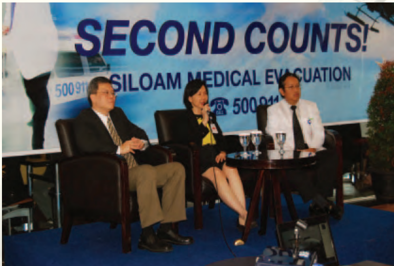
A news conference, marking the launch of "Siloam Medical Evacuation" at Siloam Hospitals Lippo Village on Feb. 24, 2010