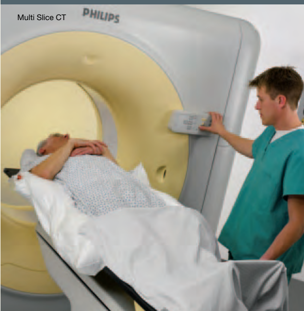
Multi Slice CT