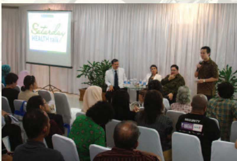
▶ Siloam Hospitals Kebon Jeruk held a Saturday Health Talk on Feb. 6, 2010. The theme was “When Chest Pain Attacks, Be Cautious With Your Heart”