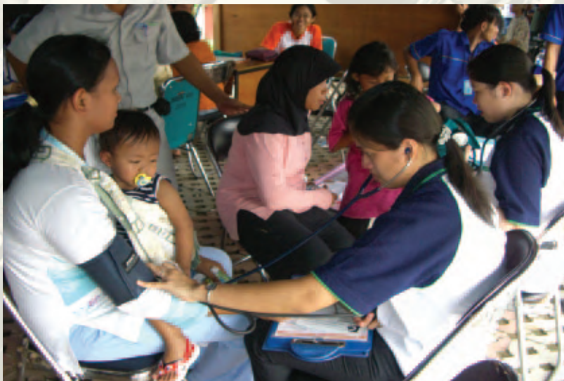
SHLV and SHKJ participated in free medication program for 1,500 low income residents held by Dian Mandiri foundation at Pamulang, on March 4, 2010