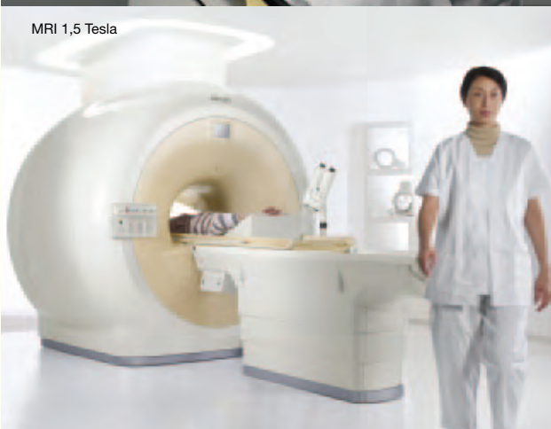
MRI 1,5 Tesla