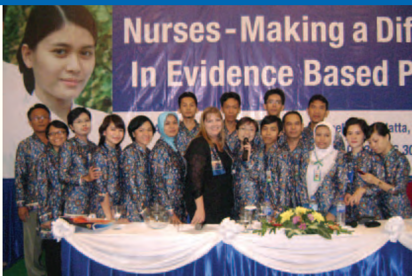
▶ Seminar on “Nurse-Making a Difference in Evidence Based Practice” at Asia Medika Hospital Jambi on Jan. 30, 2010